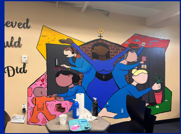
New art mural inside STH classroom.

For more information or to register go to www.walkforsth.org .